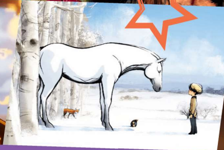
The Boy, the Mole, the Fox and the Horse.