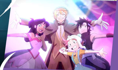
The Art of Murder